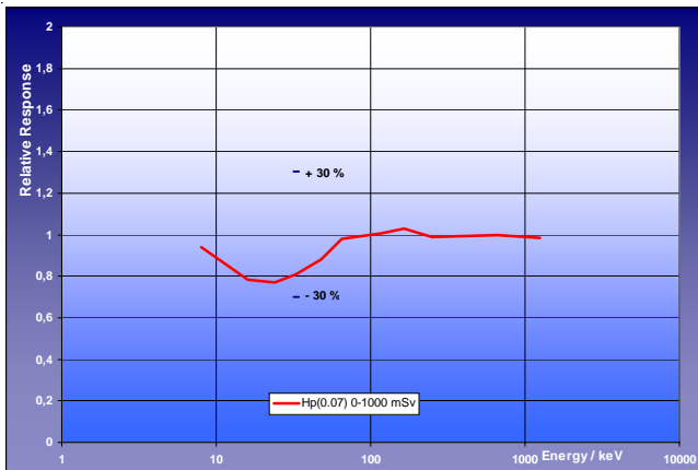
Typical energy response of personal dose equivalent H_p(0.07)